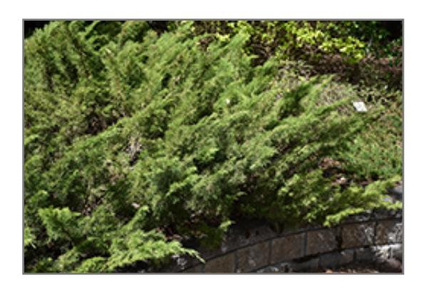
Skandia Juniper

Skandia Juniper is recommended for the following landscape applications;