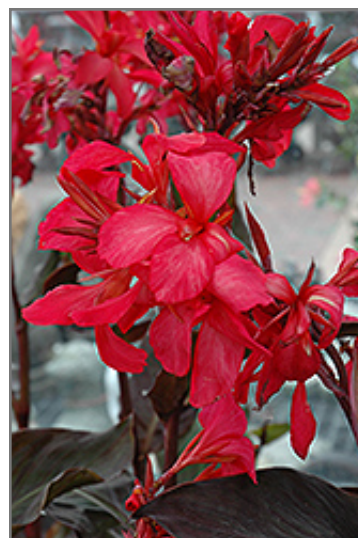
Australia Canna flowers

-- THIS IS A TROPICAL PLANT AND SHOULD NOT BE EXPECTED TO SURVIVE THE WINTER OUTDOORS IN OUR CLIMATE --