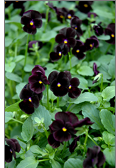
Sorbet Black Delight Pansy flowers

Sorbet Black Delight Pansy is recommended for the following landscape applications;