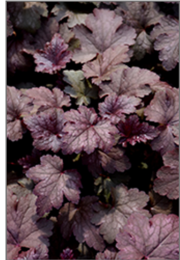
Amethyst Mist Coral Bells foliage

Amethyst Mist Coral Bells is recommended for the following landscape applications;