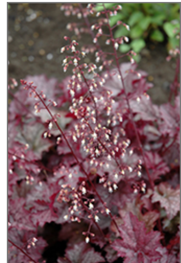
Amethyst Mist Coral Bells flowers