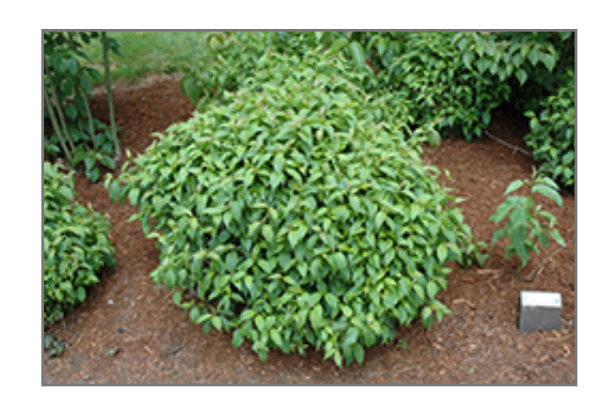
Kelsey Dogwood