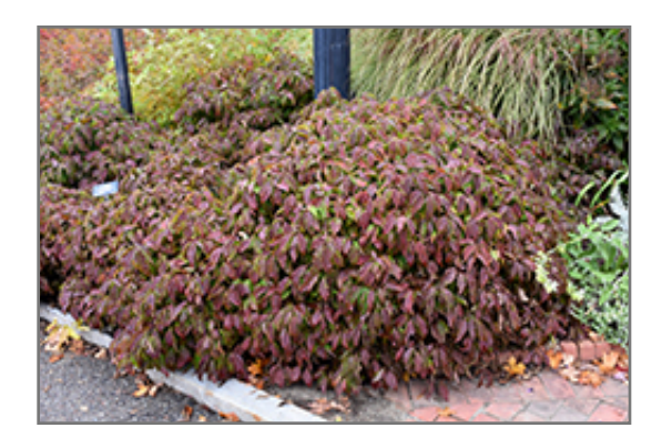
Kelsey Dogwood in fall

This shrub does best in full sun to partial shade. It is an amazingly adaptable plant, tolerating both dry conditions and even some standing water. It is not particular as to soil type or pH. It is highly tolerant of urban pollution and will even thrive in inner city environments. This is a selection of a native North American species.