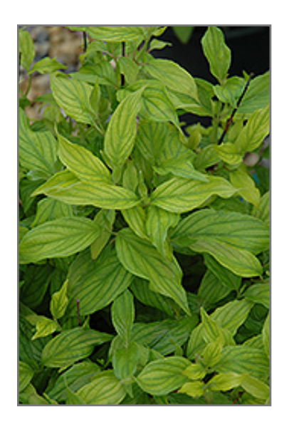
Kelsey Dogwood foliage