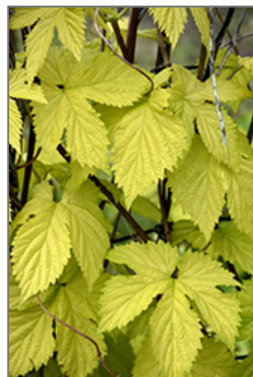
Bianca Ornamental Golden Hops foliage