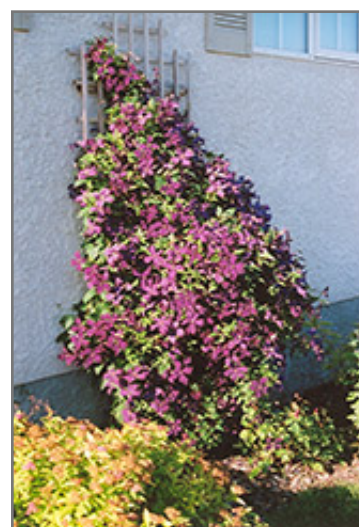
Polish Spirit Clematis in bloom