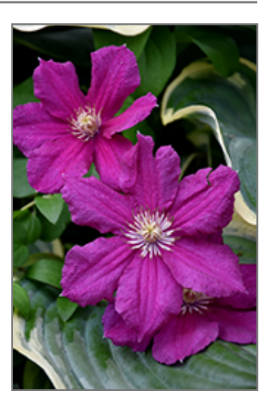
Ernest Markham Clematis flowers