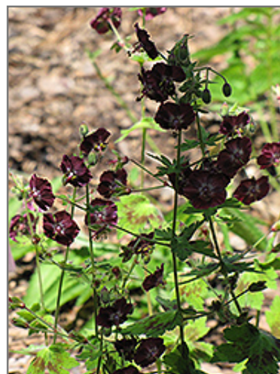
Samobor Cranesbill in bloom