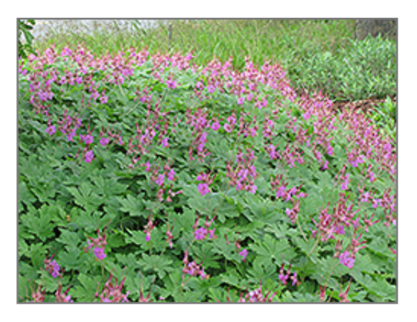
Bevan's Variety Cranesbill in bloom