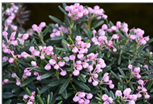
Blue Ice Bog Rosemary flowers