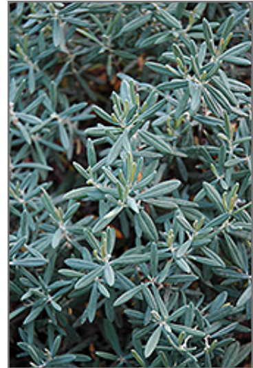
Blue Ice Bog Rosemary foliage

This shrub does best in full sun to partial shade. It prefers to grow in moist to wet soil, and will even tolerate some standing water. It is not particular as to soil type, but has a definite preference for acidic soils, and is subject to chlorosis (yellowing) of the foliage in alkaline soils. It is somewhat tolerant of urban pollution, and will benefit from being planted in a relatively sheltered location. Consider applying a thick mulch around the root zone in winter to protect it in exposed locations or colder microclimates. This is a selection of a native North American species.