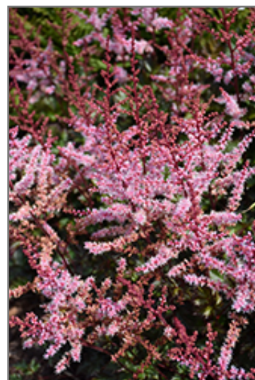
Delft Lace Astilbe flowers

Delft Lace Astilbe is recommended for the following landscape applications;