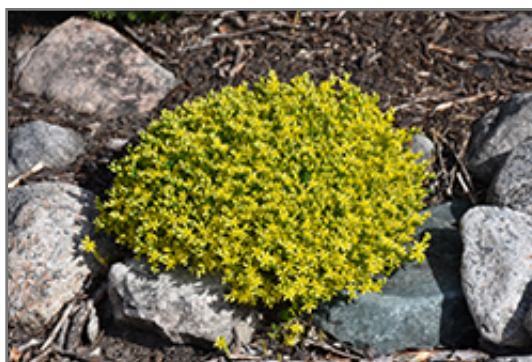
Golden Moss Stonecrop in bloom