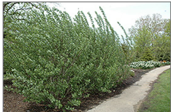
French Pussy Willow