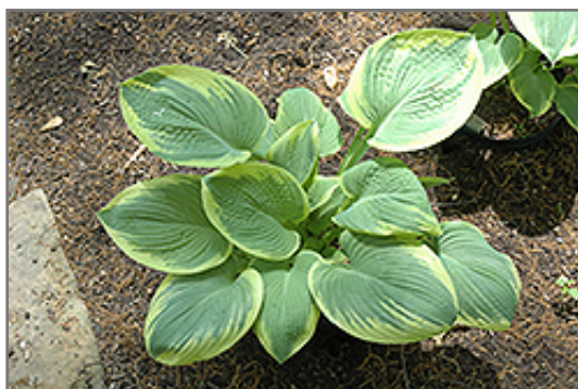
Robert Frost Hosta

Robert Frost Hosta is recommended for the following landscape applications;