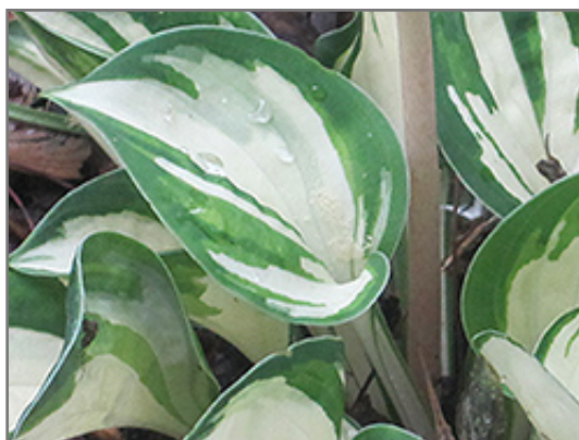
Pandora's Box Hosta foliage

Pandora's Box Hosta is recommended for the following landscape applications;