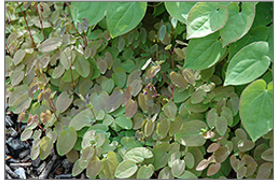
Pink Bishop's Hat foliage

Pink Bishop's Hat is recommended for the following landscape applications;