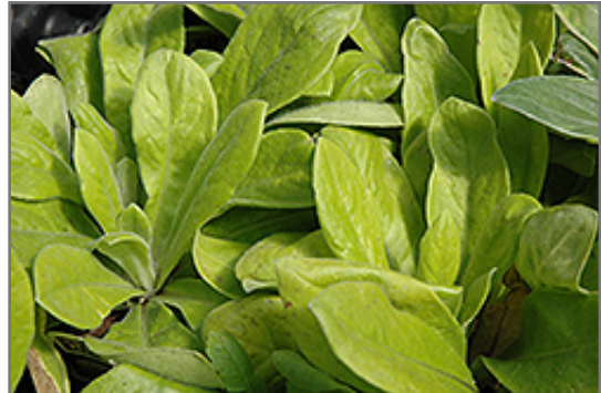
Gold Bullion Cornflower foliage