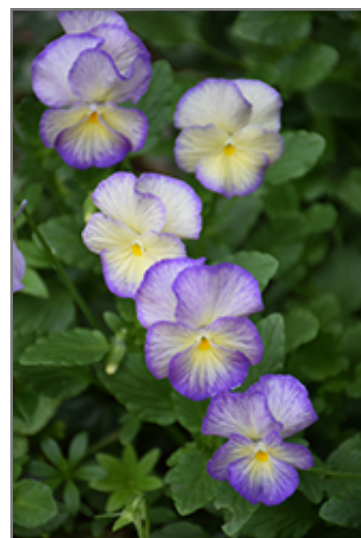
Etain Pansy flowers