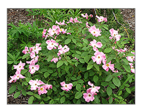
Rugosa Rose in bloom