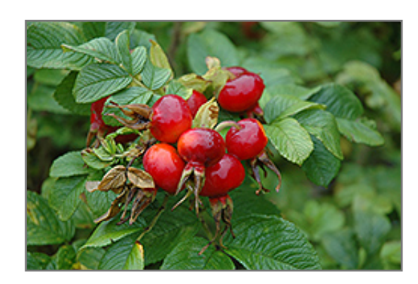
Rugosa Rose fruit

Rugosa Rose will grow to be about 5 feet tall at maturity, with a spread of 7 feet. It tends to fill out right to the ground and therefore doesn't necessarily require facer plants in front, and is suitable for planting under power lines. It grows at a fast rate, and under ideal conditions can be expected to live for approximately 25 years.