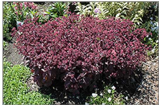
Xenox Stonecrop in bloom