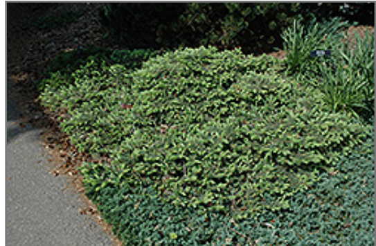
Mesa Verde Spruce