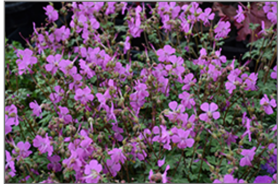
Intense Cranesbill in bloom

Intense Cranesbill is recommended for the following landscape applications;