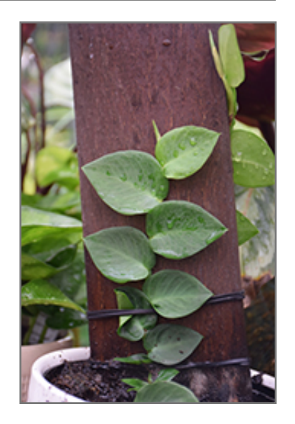
Shingle Plant foliage

There are many factors that will affect the ultimate height, spread and overall performance of a plant when grown indoors; among them, the size of the pot it's growing in, the amount of light it receives, watering frequency, the pruning regimen and repotting schedule. Use the information described here as a guideline only; individual performance can and will vary. Please contact the store to speak with one of our experts if you are interested in further details concerning recommendations on pot size, watering, pruning, repotting, etc.