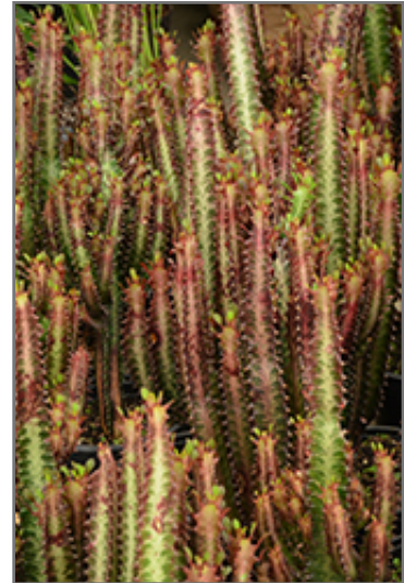
Rubra African Milk Tree stems

When grown indoors, Rubra African Milk Tree can be expected to grow to be about 9 feet tall at maturity, with a spread of 4 feet. It grows at a medium rate, and under ideal conditions can be expected to live for approximately 60 years. This houseplant will do well in a location that gets either direct or indirect sunlight, although it will usually require a more brightly-lit environment than what artificial indoor lighting alone can provide. It does best in average soil that is neither too wet nor too dry, and may die if left in standing water for any length of time. This plant should be watered when the surface of the soil gets dry, and will need watering approximately once each week. Be aware that your particular watering schedule may vary depending on its location in the room, the pot size, plant size and other conditions; if in doubt, ask one of our experts in the store for advice. Like most succulents and cacti, it prefers to grow in poor soils and should therefore never be fertilized. It is not particular as to soil pH, but grows best in sandy soil. Contact the store for specific recommendations on pre-mixed potting soil for this plant. Be warned that parts of this plant are known to be toxic to humans and animals, so special care should be exercised if growing it around children and pets.