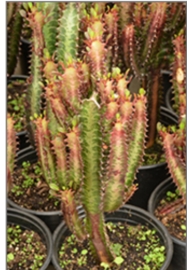
Rubra African Milk Tree in full