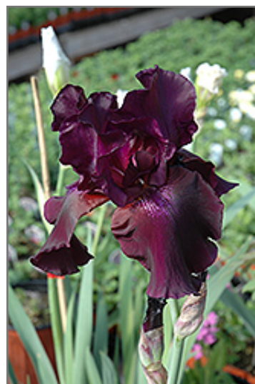
Superstition Iris flowers