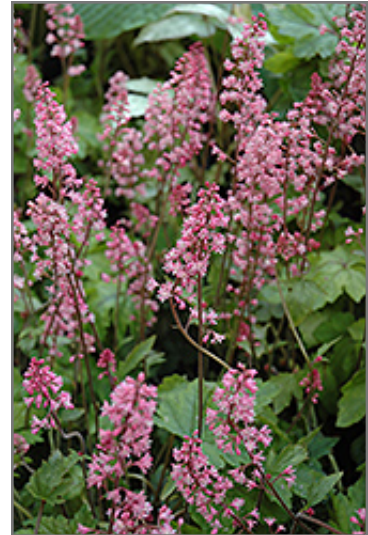
Dayglow Pink Foamy Bells flowers

Dayglow Pink Foamy Bells is recommended for the following landscape applications;