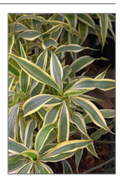
Variegated Ribbon Dracaena foliage

When grown indoors, Variegated Ribbon Dracaena can be expected to grow to be about 3 feet tall at maturity, with a spread of 18 inches. It grows at a medium rate, and under ideal conditions can be expected to live for approximately 10 years. This houseplant performs well in both bright or indirect sunlight and strong artificial light, and can therefore be situated in almost any well-lit room or location. It does best in average to evenly moist soil, but will not tolerate standing water. The surface of the soil shouldn't be allowed to dry out completely, and so you should expect to water this plant once and possibly even twice each week. Be aware that your particular watering schedule may vary depending on its location in the room, the pot size, plant size and other conditions; if in doubt, ask one of our experts in the store for advice. It will benefit from a regular feeding with a general-purpose fertilizer with every second or third watering. It is not particular as to soil type or pH; an average potting soil should work just fine.