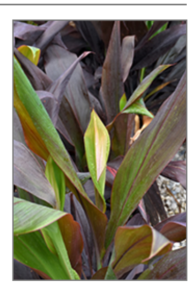
Black Magic Hawaiian Ti Plant foliage

When grown indoors, Black Magic Hawaiian Ti Plant can be expected to grow to be about 6 feet tall at maturity, with a spread of 4 feet. It grows at a medium rate, and under ideal conditions can be expected to live for approximately 10 years. This houseplant will do well in a location that gets either direct or indirect sunlight, although it will usually require a more brightly-lit environment than what artificial indoor lighting alone can provide. It does best in average to evenly moist soil, but will not tolerate standing water. The surface of the soil shouldn't be allowed to dry out completely, and so you should expect to water this plant once and possibly even twice each week. Be aware that your particular watering schedule may vary depending on its location in the room, the pot size, plant size and other conditions; if in doubt, ask one of our experts in the store for advice. It will benefit from a regular feeding with a general-purpose fertilizer with every second or third watering. It is not particular as to soil type or pH; an average potting soil should work just fine.