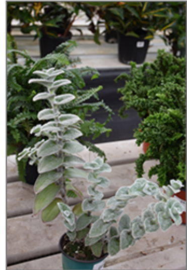
Cobweb Spiderwort in full

This is an herbaceous evergreen houseplant with an upright spreading habit of growth. Its relatively fine texture sets it apart from other indoor plants with less refined foliage. This plant may benefit from an occasional pruning to look its best.