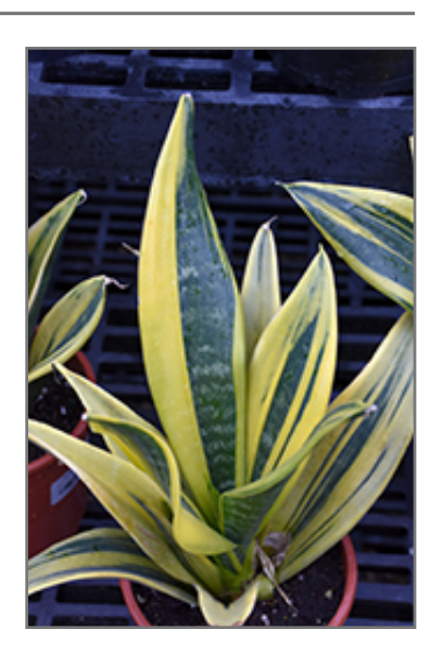
Golden Flame Snake Plant flowers

When grown indoors, Golden Flame Snake Plant can be expected to grow to be about 3 feet tall at maturity, with a spread of 24 inches. It grows at a slow rate, and under ideal conditions can be expected to live for approximately 10 years. This houseplant performs well in both bright or indirect sunlight and strong artificial light, and can therefore be situated in almost any well-lit room or location. It is very adaptable to both dry and moist soil, but will not tolerate any standing water. The surface of the soil shouldn't be allowed to dry out completely, and so you should expect to water this plant once and possibly even twice each week. Be aware that your particular watering schedule may vary depending on its location in the room, the pot size, plant size and other conditions; if in doubt, ask one of our experts in the store for advice. It will benefit from a regular feeding with a general-purpose fertilizer with every second or third watering. It is not particular as to soil pH, but grows best in sandy soil. Contact the store for specific recommendations on pre-mixed potting soil for this plant.