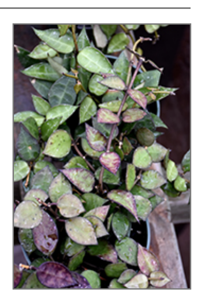
Hoya Krohniana foliage

There are many factors that will affect the ultimate height, spread and overall performance of a plant when grown indoors; among them, the size of the pot it's growing in, the amount of light it receives, watering frequency, the pruning regimen and repotting schedule. Use the information described here as a guideline only; individual performance can and will vary. Please contact the store to speak with one of our experts if you are interested in further details concerning recommendations on pot size, watering, pruning, repotting, etc.