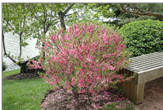
Russian Almond in bloom