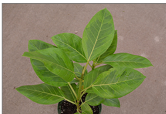
Altissima Council Tree in full