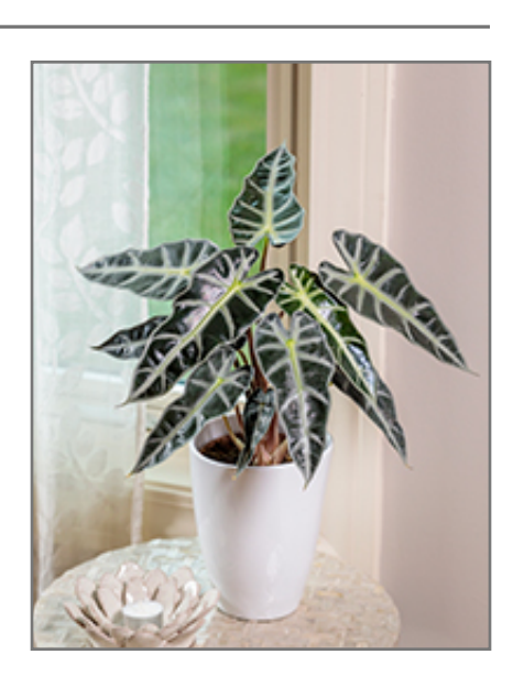
Mythic Bambino Jewel Alocasia in full

When grown indoors, Mythic Bambino Jewel Alocasia can be expected to grow to be about 14 inches tall at maturity, with a spread of 12 inches. It grows at a medium rate, and under ideal conditions can be expected to live for approximately 5 years. This houseplant should be situated in a location that that gets indirect sunlight at most, although it will usually require a more brightly-lit environment than what artificial indoor lighting alone can provide. It does best in average to evenly moist soil, but will not tolerate standing water. The surface of the soil shouldn't be allowed to dry out completely, and so you should expect to water this plant once and possibly even twice each week. Be aware that your particular watering schedule may vary depending on its location in the room, the pot size, plant size and other conditions; if in doubt, ask one of our experts in the store for advice. It will benefit from a regular feeding with a general-purpose fertilizer with every second or third watering. It is not particular as to soil pH, but grows best in rich soil. Contact the store for specific recommendations on pre-mixed potting soil for this plant. Be warned that parts of this plant are known to be toxic to humans and animals, so special care should be exercised if growing it around children and pets.