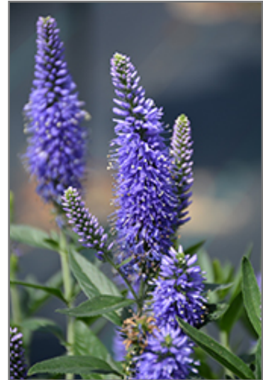
Skyward Blue Long-leaf Speedwell flowers

Skyward Blue Long-leaf Speedwell is a fine choice for the garden, but it is also a good selection for planting in outdoor pots and containers. It is often used as a 'filler' in the 'spiller-thriller-filler' container combination, providing a mass of flowers against which the larger thriller plants stand out. Note that when growing plants in outdoor containers and baskets, they may require more frequent waterings than they would in the yard or garden. Be aware that in our climate, most plants cannot be expected to survive the winter if left in containers outdoors, and this plant is no exception. Contact our experts for more information on how to protect it over the winter months.