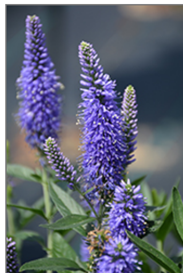
Skyward Blue Long-leaf Speedwell flowers

Skyward Blue Long-leaf Speedwell is a fine choice for the garden, but it is also a good selection for planting in outdoor pots and containers. It is often used as a 'filler' in the 'spiller-thriller-filler' container combination, providing a mass of flowers against which the larger thriller plants stand out. Note that when growing plants in outdoor containers and baskets, they may require more frequent waterings than they would in the yard or garden. Be aware that in our climate, most plants cannot be expected to survive the winter if left in containers outdoors, and this plant is no exception. Contact our experts for more information on how to protect it over the winter months.