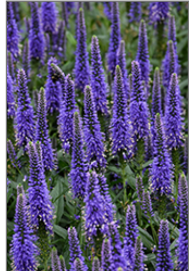
Skyward Blue Long-leaf Speedwell flowers