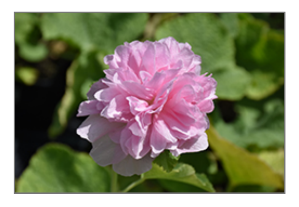
Peaches n' Dreams Hollyhock flowers