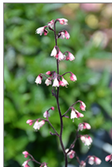
Dolce Frosted Berry Coral Bells flowers

Dolce Frosted Berry Coral Bells is a fine choice for the garden, but it is also a good selection for planting in outdoor pots and containers. With its upright habit of growth, it is best suited for use as a 'thriller' in the 'spiller-thriller-filler' container combination; plant it near the center of the pot, surrounded by smaller plants and those that spill over the edges. Note that when growing plants in outdoor containers and baskets, they may require more frequent waterings than they would in the yard or garden. Be aware that in our climate, most plants cannot be expected to survive the winter if left in containers outdoors, and this plant is no exception. Contact our experts for more information on how to protect it over the winter months.