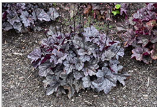
Dolce Frosted Berry Coral Bells