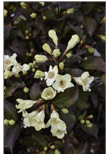
Wine & Spirits Weigela flowers