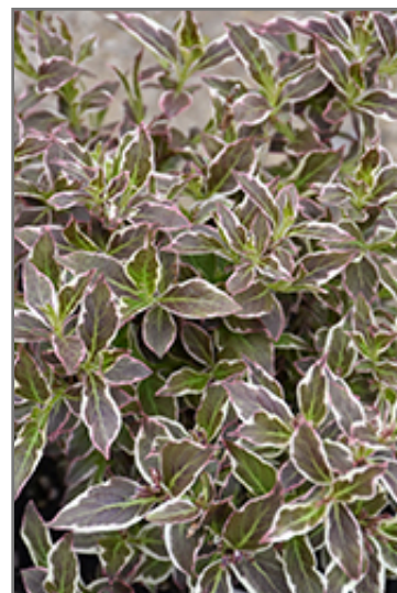
My Monet Purple Effect Weigela foliage