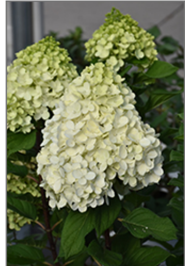
Little Lime Punch Hydrangea flowers