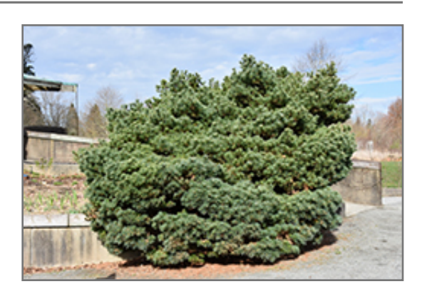
Blue Shag White Pine