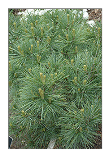
Blue Shag White Pine foliage