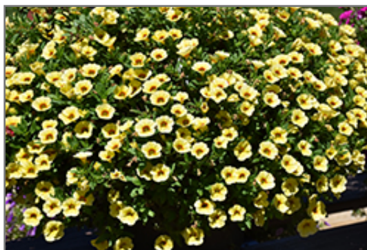
MiniFamous Uno Yellow+Red Vein Calibrachoa flowers