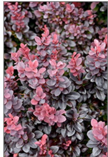
Concorde Japanese Barberry foliage