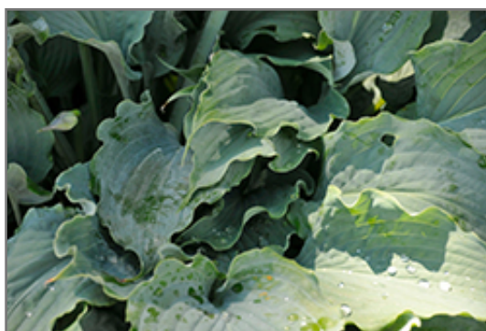
Wind Beneath My Wings Hosta foliage