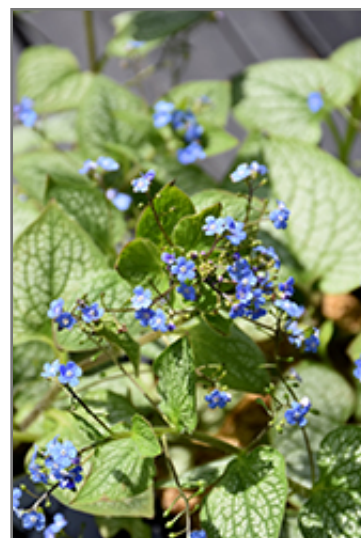
Jack of Diamonds Bugloss flowers