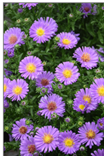
Kickin Lilac Blue Aster flowers