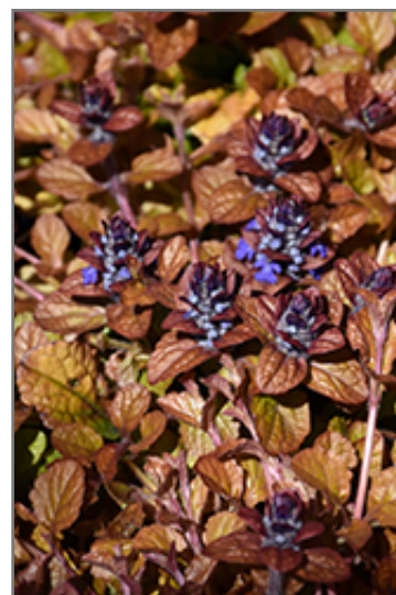
Feathered Friends Parrot Paradise Bugleweed flowers