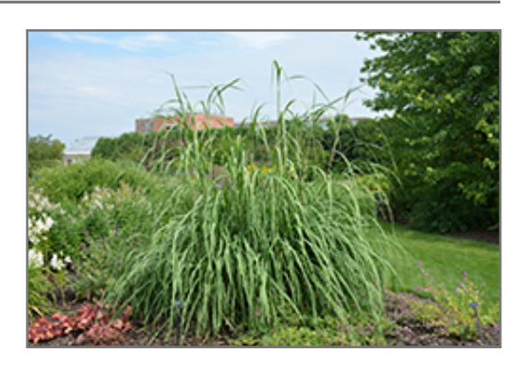
Ravenna Grass

Ravenna Grass is recommended for the following landscape applications;