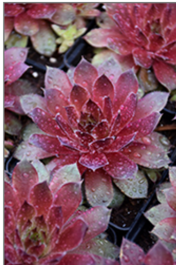
More Honey Hens And Chicks